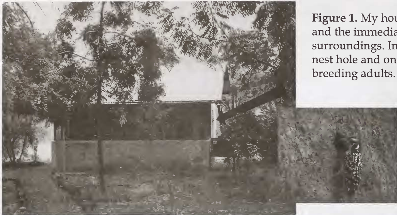
Figure 1. My house and the immediate surroundings. Inset: the nest hole and one of the breeding adults.